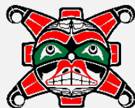
Quatern Limited Partnership

focused on strategic partnerships and co-ownership